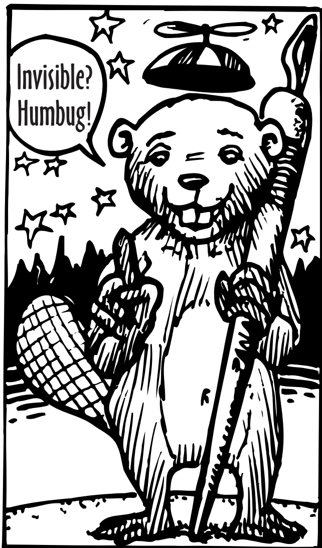
Ken Fletcher '97